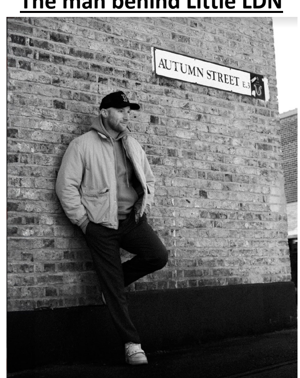
The man behind Little LDN

We are committed to creating a dynamic and inclusive space that serves as more than just a traditional venue. By combining elements of work, food, socializing, and community engagement, we aspire to foster a sense of belonging and connection among our patrons. We look forward to welcoming you to our venue and experiencing the vibrant atmosphere.